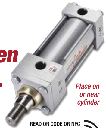
Place on or near cylinder

No more guesswork when replacing your cylinder.